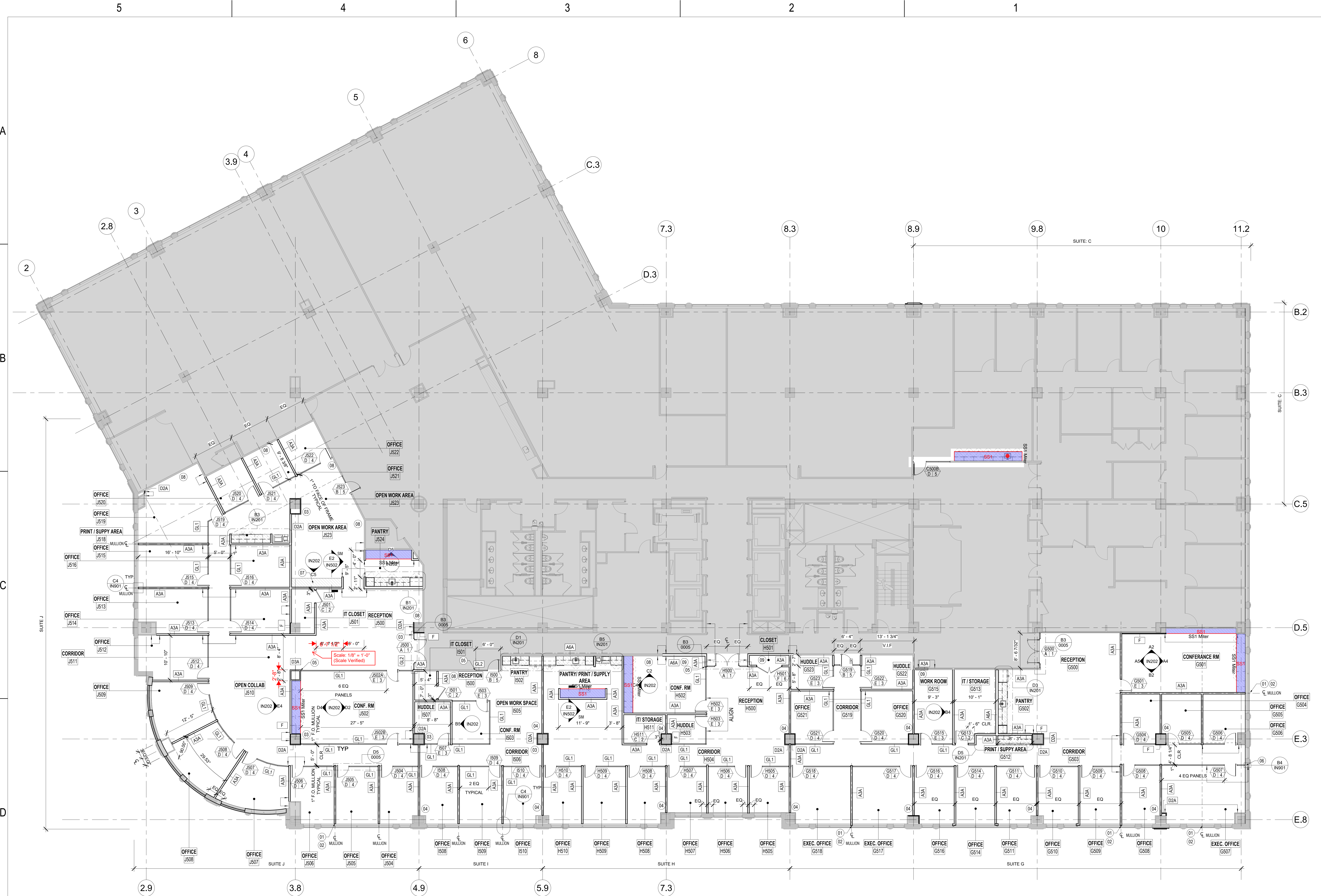
D5 5TH FLOOR CONSTRUCTION PLAN SCALE: 1/8" = 1'-0"